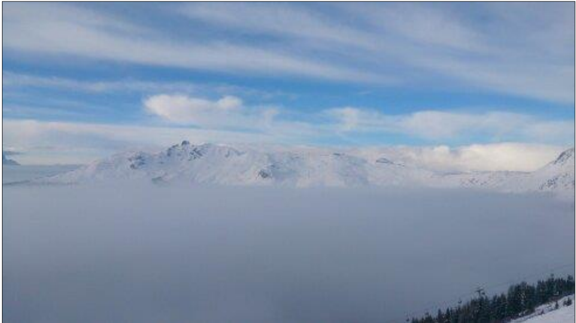
Once up above the clouds the sun came out giving fantastic skiing conditions