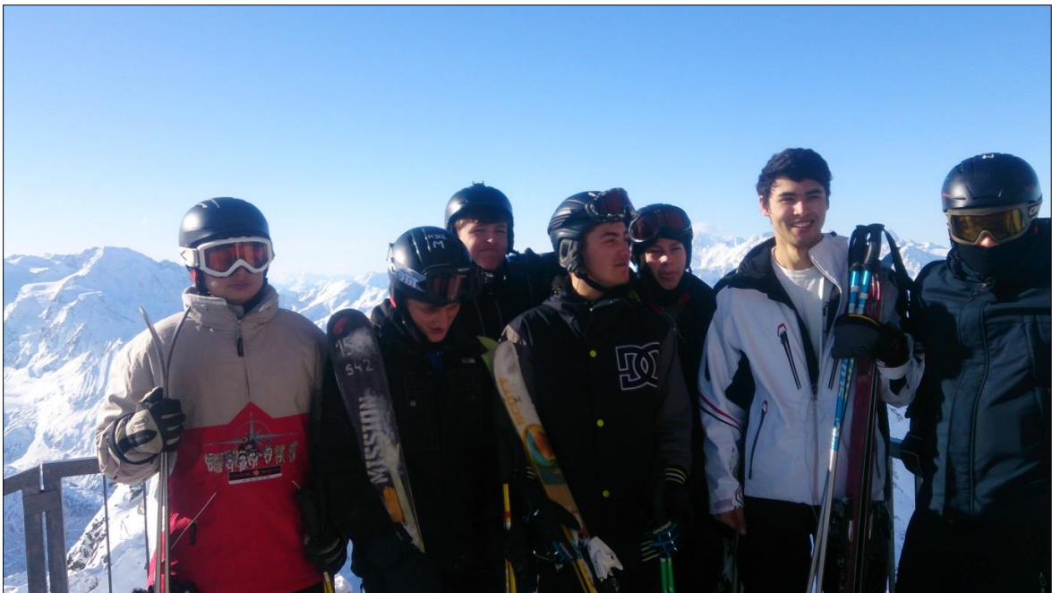
Some of the boys right at the top of Mont Fort with Mont Blanc in the background.